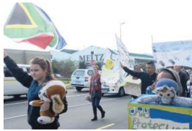
Marching against child abuse page 5 >>