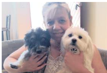
Case of the missing parlour pooch page 13 >>