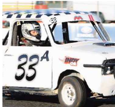
Mini driver hopes to move up to the big league page 19 >>