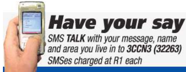
Have your say SMS TALK with your message, name and area you live in to 3CCN3 (32263) SMSes charged at R1 each

There are about 100 000 active editors who are all volunteers. Anybody can edit and contribute content to the